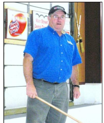
1 President "Ice Maker" at work